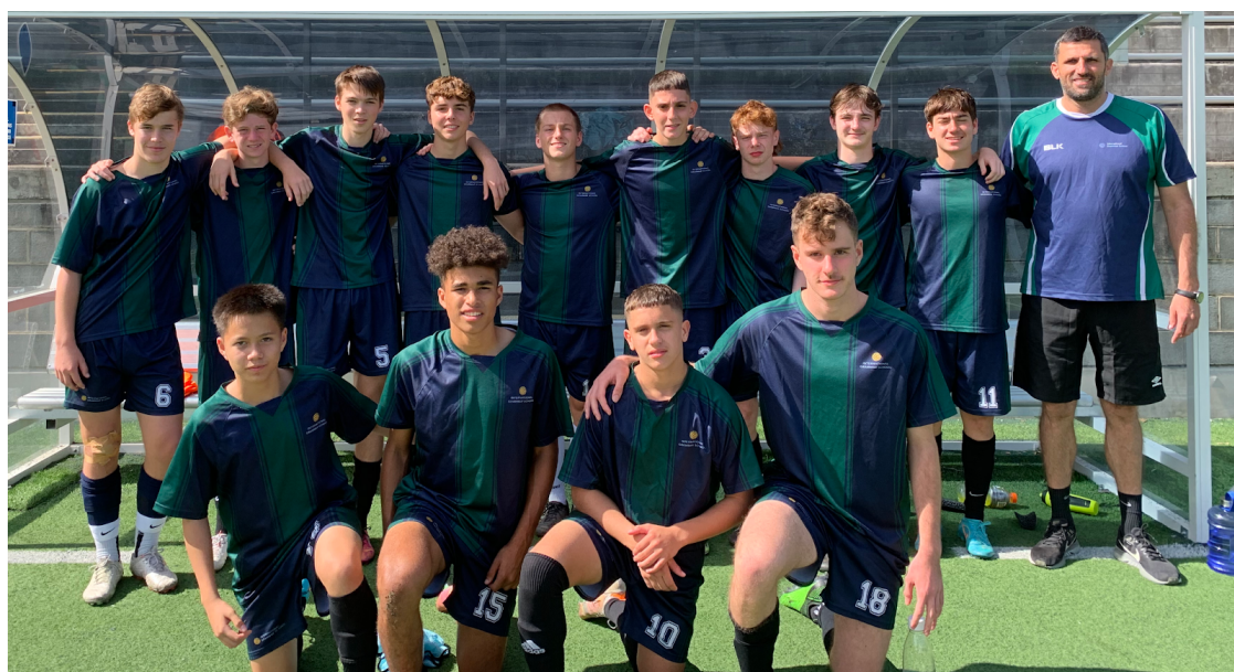
St Andrews Cup IST XI 2022